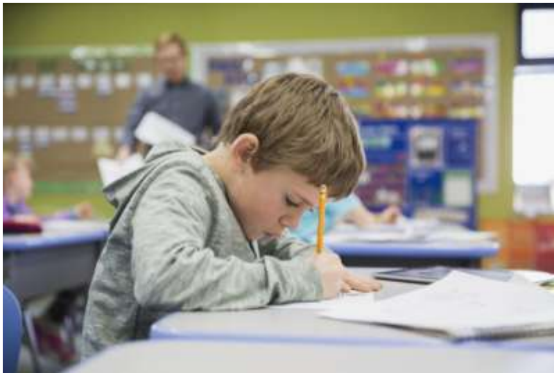
Help with Homework