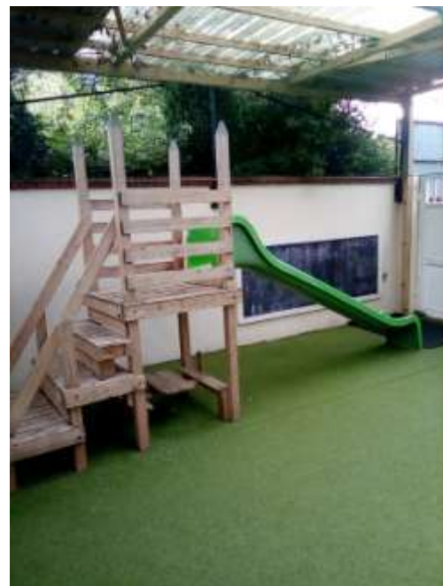
Indoor & outdoor play